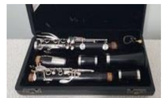
Yamaha Custom clarinet cs serial no 01162. $1300.00