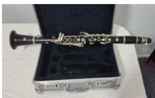
Clarinet Selmer gold seal London $1100.00