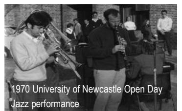
1970 University of Newcastle Open Day Jazz performance