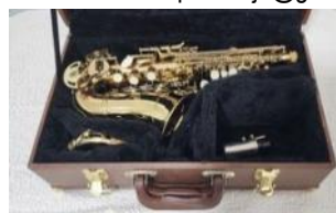
Geranda soprano saxophone ser no 81235. $400.00