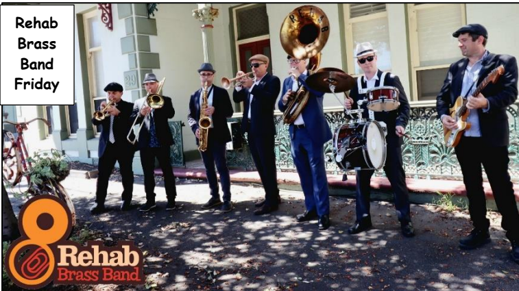
Rehab Brass Band Friday