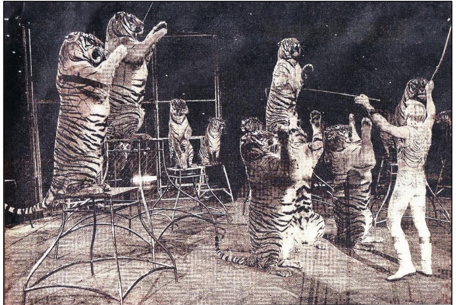
CIRCUS ACT: Gunther Gebel-Williams and his tigers at Ringling Bros and Barnum and Bailey Circus in 1976.

The band usually performed from a platform made of "painter's planks tied together". It wouldn't pass occupational health and safety checks nowadays. "The band was traditionally placed above the performers' entrance on a very shaky and just big enough platform for the orchestra," he said.